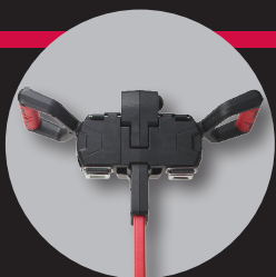
2 Position Handle