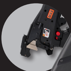
2 Nose attachments available for different distance from ground