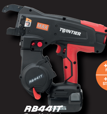
RB441T (From 20-44mm)