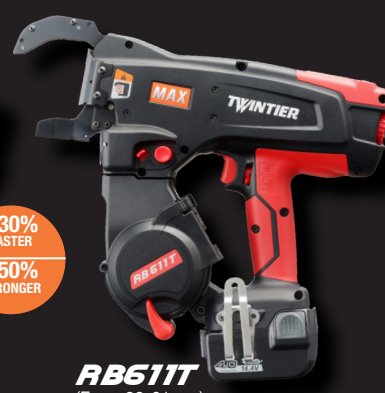
RB611T (From 32-61mm)